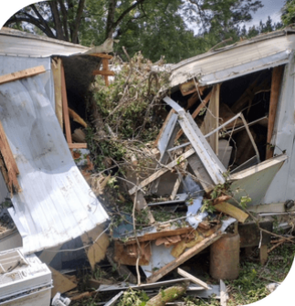
Recipient's Home Damaged from Hurricane

Stay in the loop on all things HCSG by following us on our social media channels!