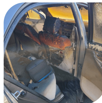
Recipient's Car Damaged from Fire